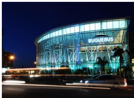
Buquebus port terminal in Buenos Aires