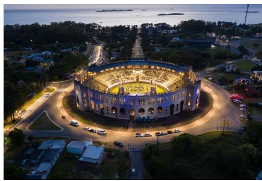
Plaza de Toros Real de San Carlos