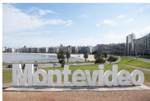
Rambla of Montevideo