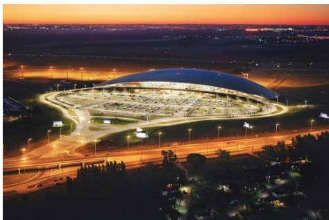
Carrasco International Airport

The main airlines in the world, with regional flights from Buenos Aires, Porto Alegre, Sao Paulo, Rio de Janeiro, Asunción, Panama, Santiago de Chile and Lima arrive at the airport. Also, numerous frequencies of ships and ferries unite Buenos Aires with Colonia del Sacramento in approximately one hour.