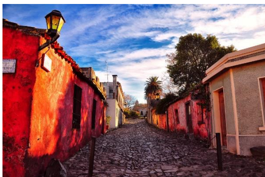
Colonia del Sacramento

Founded in 1680 by the Portuguese Manuel Lobo, the city passed from Portuguese to Spanish rule several times, until the Declaration of Independence of the Banda Oriental in 1825. These events made the Historic Center of the colonial capital a melting pot of architectural and urban styles in which typically Portuguese colonial styles and Spanish-style houses coexist. More information about Colonia del Sacramento.